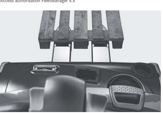
View on tip of forks