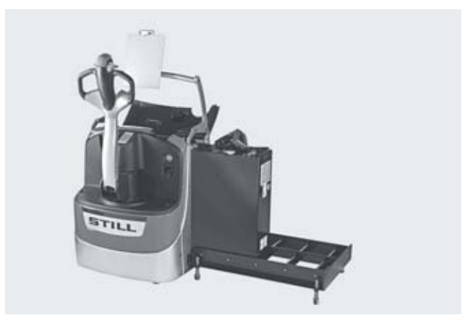
Lateral battery change