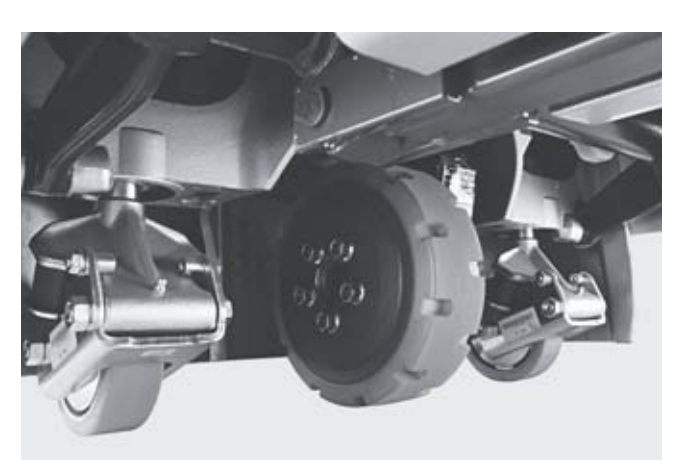
Profiled drive wheel